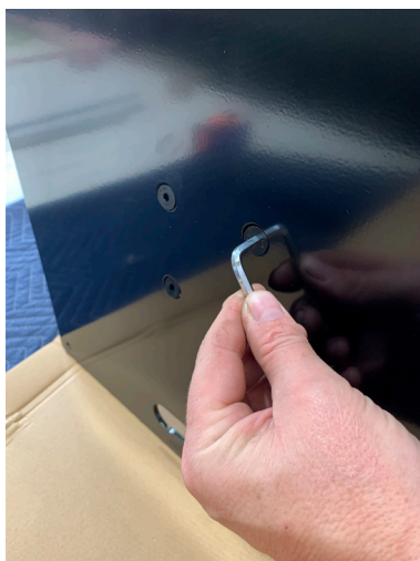
Place allen key into bolt