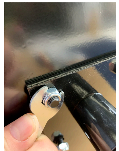
Turn the allen key while holding the nut with the spanner. Keep turning the allen key until the bolt passes all the way through the blue nylon locking ring on the nut. Tighten fully.