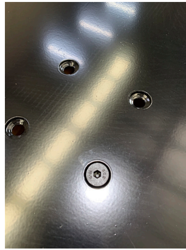
Place counter sink bolt into counter sink side of the plate