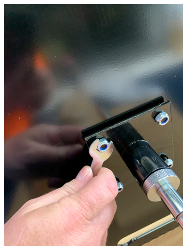
Place spanner on the nut